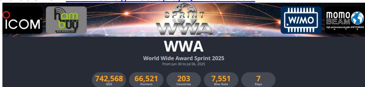
Figure 1. WWA Sprint July 2025 summary statistics

Overall, the event was a success. Figure 1 contains the total number of QSOs generated over the seven-day event along with other summary data. Additional information is available from N4W - Callsign Lookup by QRZ Ham Radio