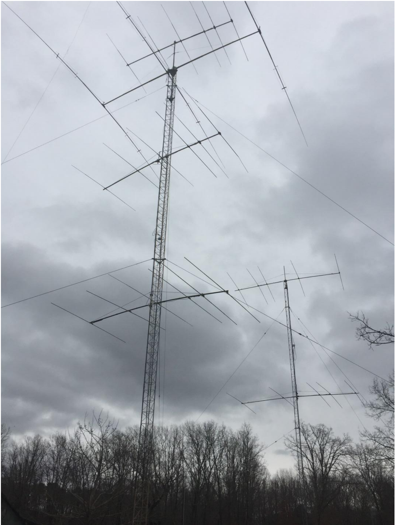
Some of the antennas at K0EJ's. Foreground: 40M tower (85') with 3-high stack of 6L10M yagis and 3L40. Background is 15M tower (75') with 2 5L15M yagis.