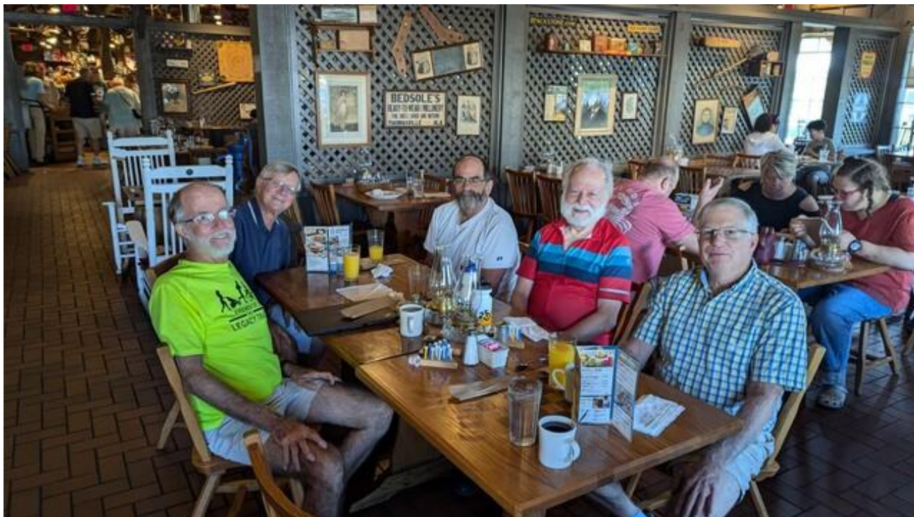
Clockwise: K8MR, KV8Q, K3TN, K3LA, AD4EB, Sunday morning after the OHQP. Mobile operations were K8MR/K3LA, KV8Q/AD4EB, K3TN

Here is a selected list, as of this publication, of those who put up scores on 3830 Scores Summary in August: